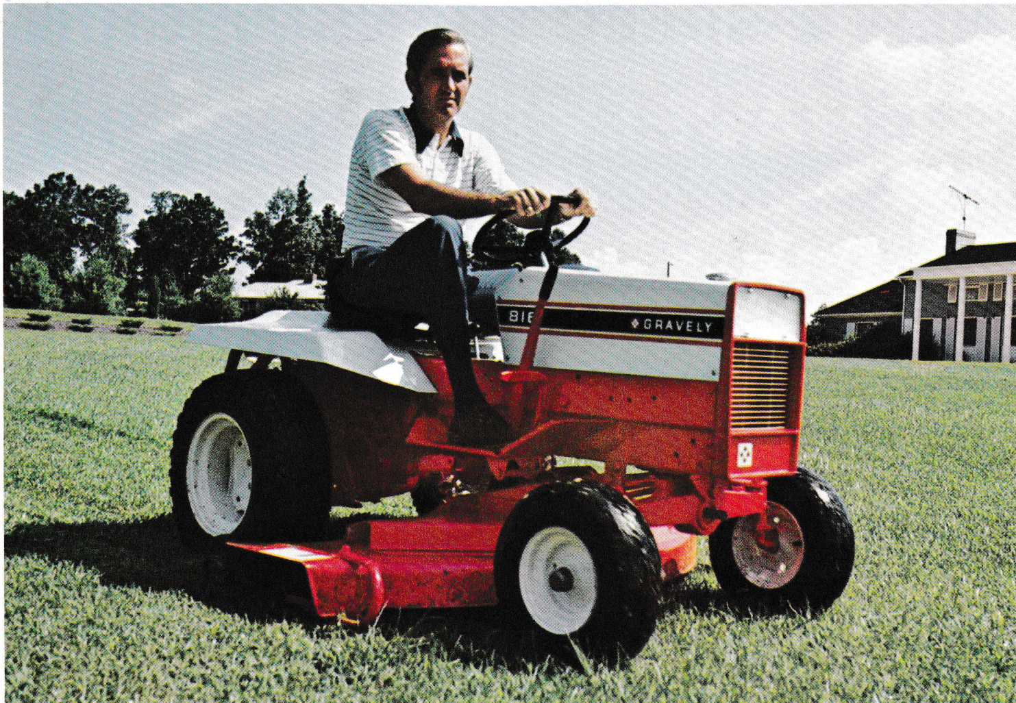
Gravely 816 Riding Tractor with 50-inch Rotary Mower